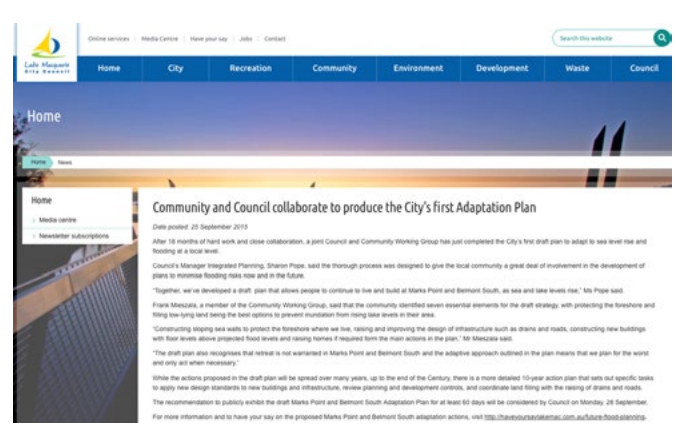
Figure 3: A media report of the community response to Council's communication activities.